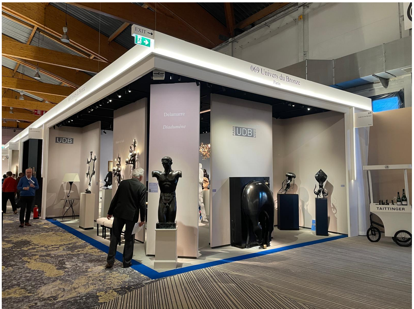
Stand UDB at BRAFA 2025