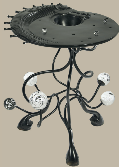
LA FUREUR DE L'HIPPOCAMPE Guéridon H: 60,5 cm L: 50 cm