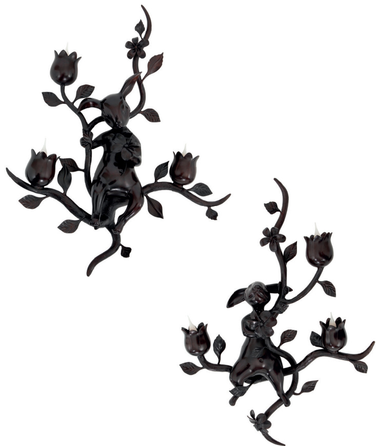
ROMÉO ET JULIETTE Appliques (Variant) (2023) Bronze, H : 88 cm, L : 55 cm, D : 15 cm

He particularly impressed us recently, with latest developments in his work, with an approach of animal sculpture and especially a rather humorous dimension as it can be seen in Astrocrokylus , on a bronze core. This one is composed of yellow and white golden aluminum, with in its middle part a floral explosion in porcelain.