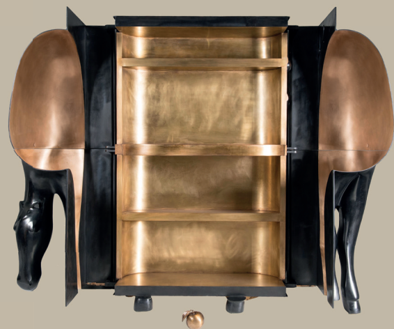
L'ÉTERNEL PRINTEMPS (2018) Cabinet Black and polished bronze H: 161 cm, L: 100 cm, D: 54 cm