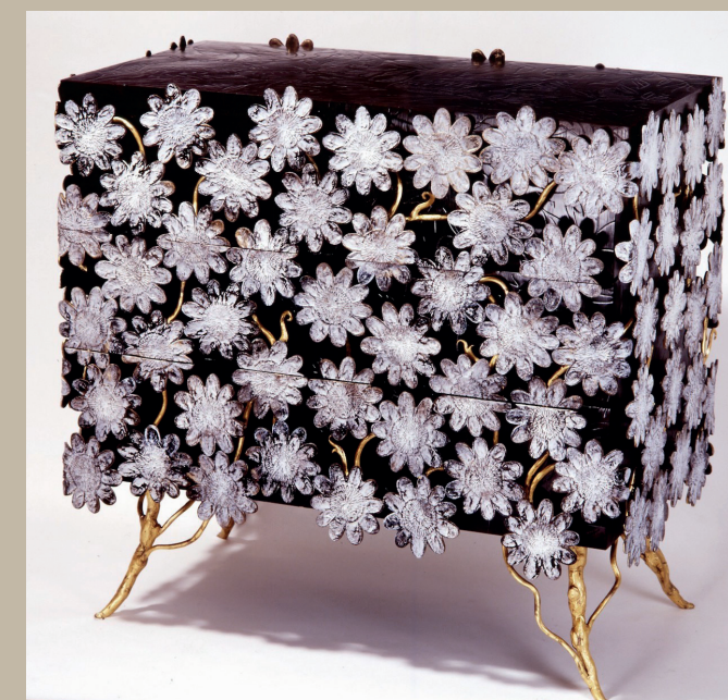
COMMODE ANTHEMIS H: 105 cm L: 110 cm D: 60 cm