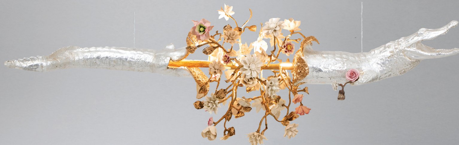
ASTROCROKYLUS Suspension Aluminium, gilt bronze, porcelain L : 173 cm