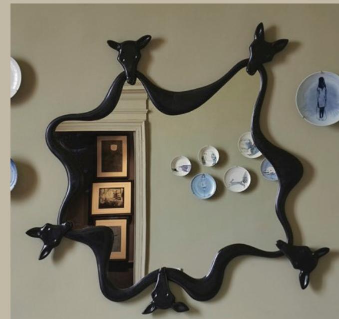
GRAND LOOPY Mirror H: 98 cm L: 128 cm